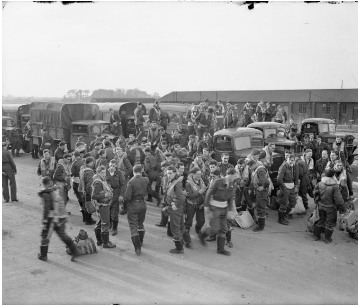
Aircrew about to be ferried out to their aircraft.